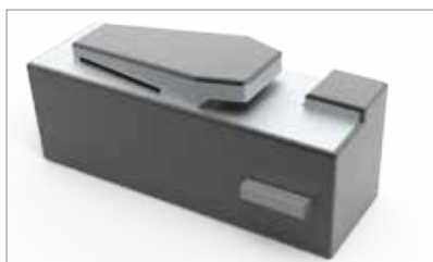
PNEUMO-HYDRAULIC PUMP POMPA PNEUMOIDRAULICA