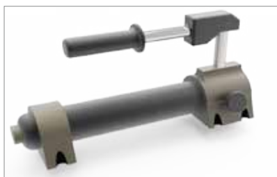
MANUAL PUMP POMPA MANUALE